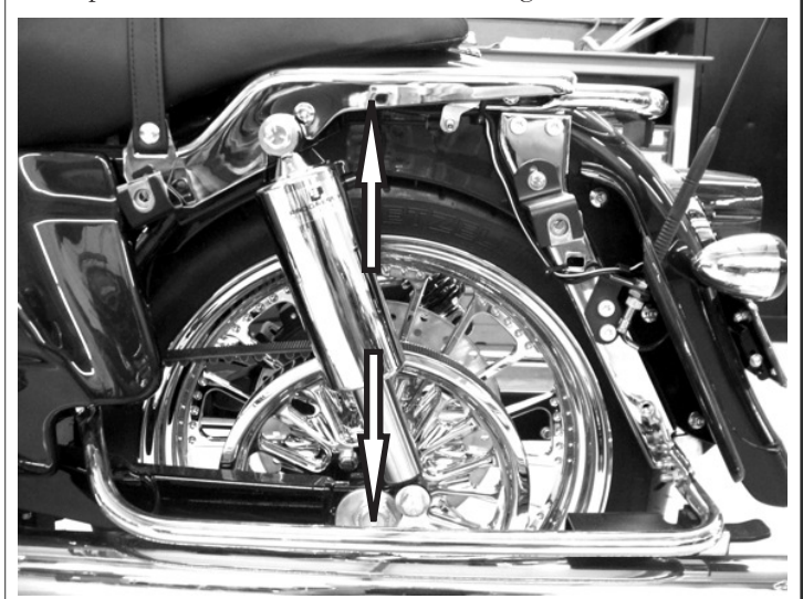
Photo 5 The difference in measurements between the axle and the fender rail with the suspension fully extended and then with rider(s) on the bike is your Ride Sag. This difference should be 1.0" - 1.2" for maximum ride comfort.