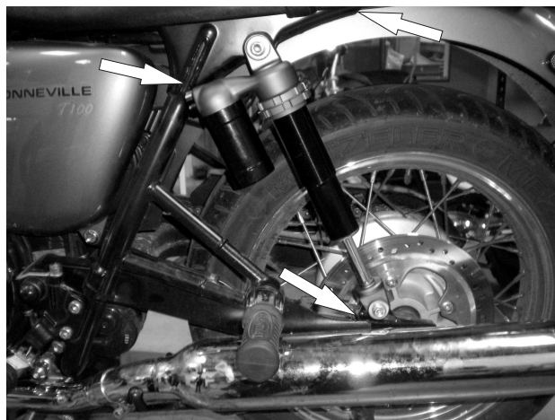
Fig1 (shown on “T-100”)

Compliment your new shocks with a set of Progressive Suspension fork springs.